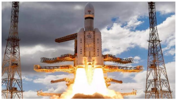
On 23 August, India successfully completed Chandrayaan-3's landing on the Moon. Its efforts were lauded across countries